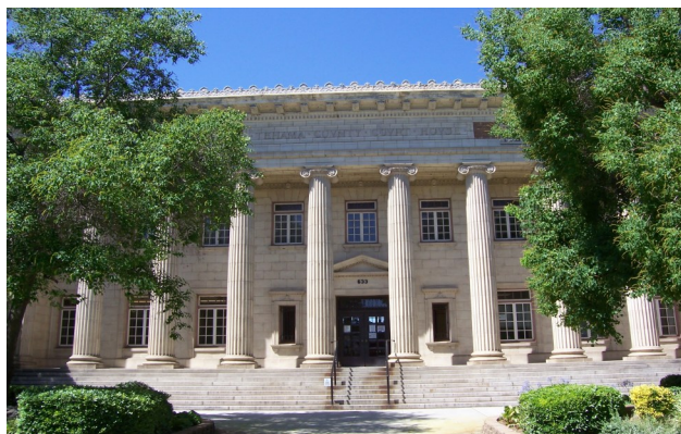
ERECTED IN 1920